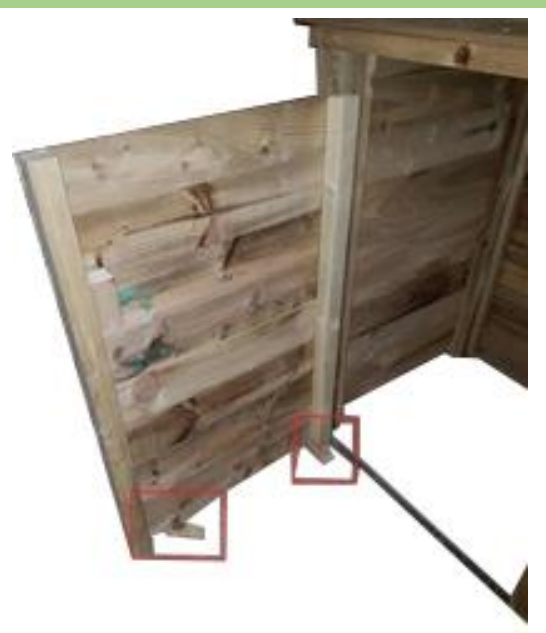
Arrange the two spacer blocks on the ground, adjacent to the end front, as shown in the photo.