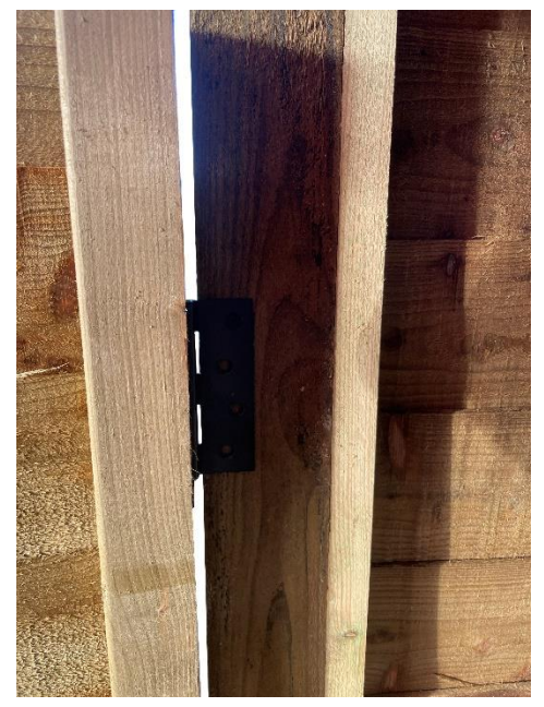
Use black screws to secure the doors.