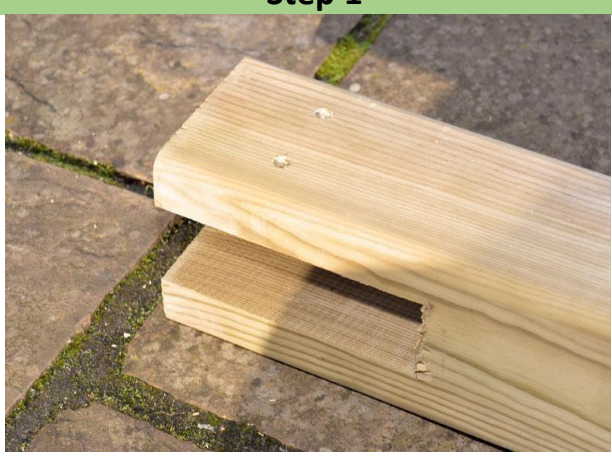
Take one of the posts and one of the runners and arrange on the floor as shown