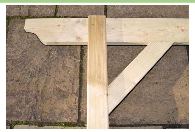
Place 500mm brace (standard or sculpted) as shown, align it so that its ends are flat and central against the runner and post.