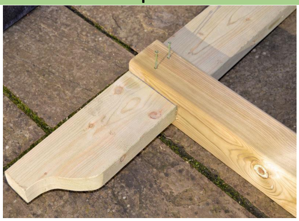
Now slide one of the runners and secure it with provided screws. Please note both sides of the runner must have the overhang of 40.5 cm.