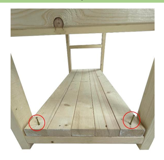
Fit the bottom shelf in position. Centralize and secure using the screws supplied.