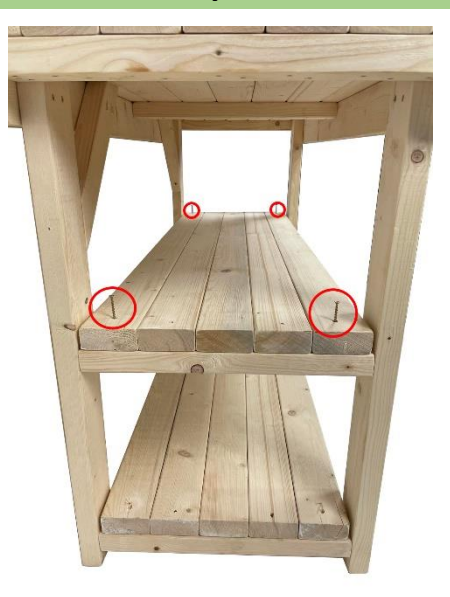
Repeat this step if you have ordered double shelf option.