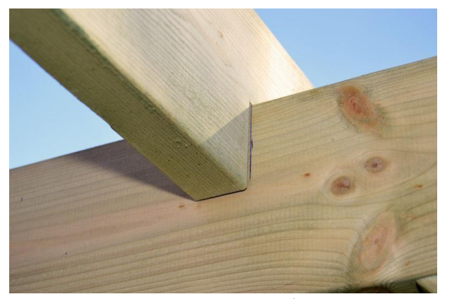
Continue adding the remaining rafters, use provided spacer to measure correct distance in between. Repeat this step until all the rafters are in place.