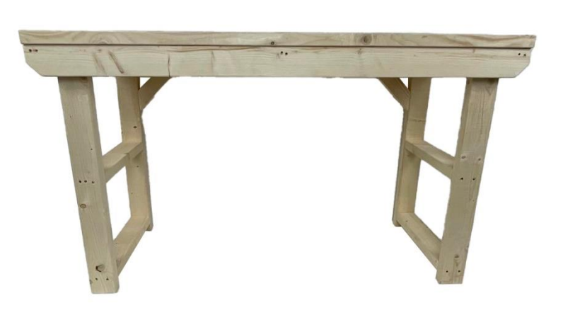
Rotate the workbench and prepare to slide in the shelfs.