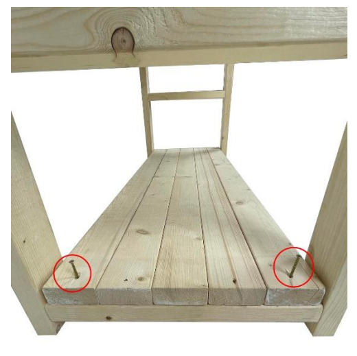
Fit the bottom shelf in position. Centralize and secure using the screws supplied.