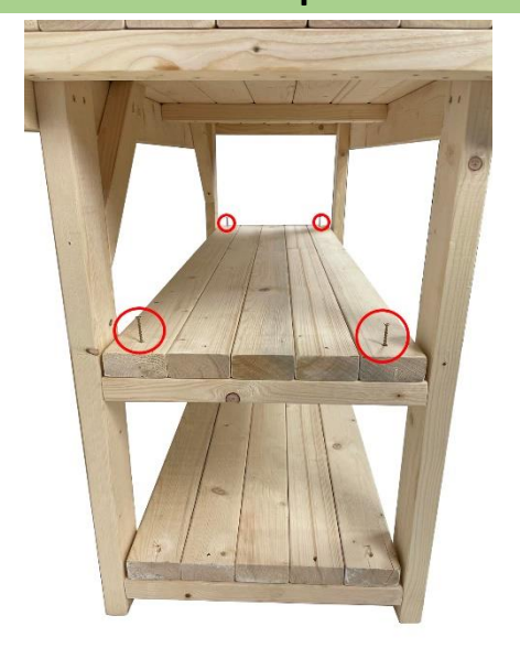
Repeat this step if you have ordered double shelf option.