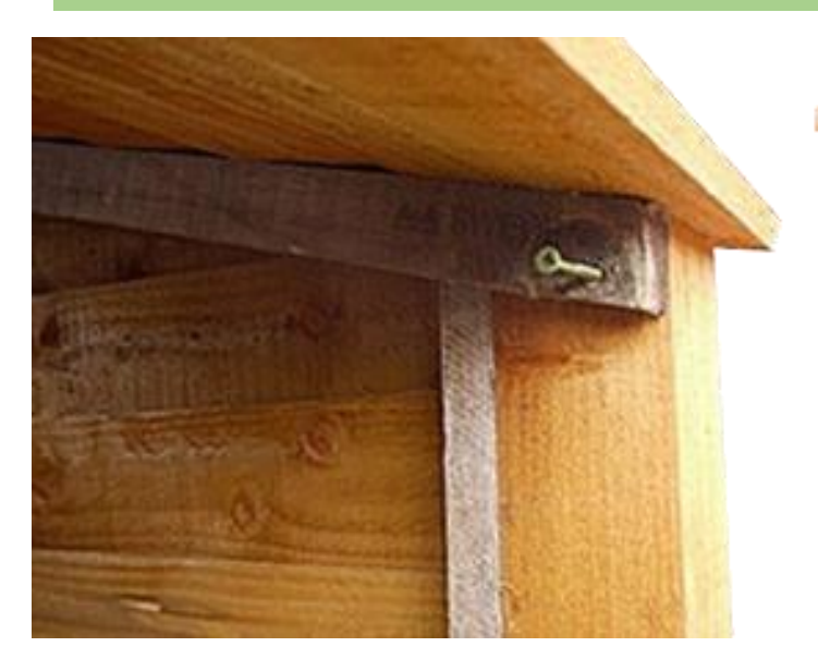
Step 11 Step 12

Check that the front batten ends sit flush with the posts as shown. Now attach the roof to each end panel post with 65mm screws.